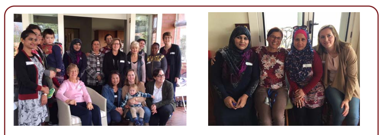
During the year, Club members have enjoyed getting to know the ladies from Ishar through lunch events.

ZHRA continues to demonstrate effective programs to assist women recover from trauma and gain sustainable positive changes in their lives. Over the years, the Zonta Club of Perth has provided service, advocacy and fundraising activities to benefit ZHRA, in particular the Positive Pathways Program. This year we donated $1,000 to support the continuation of that program.