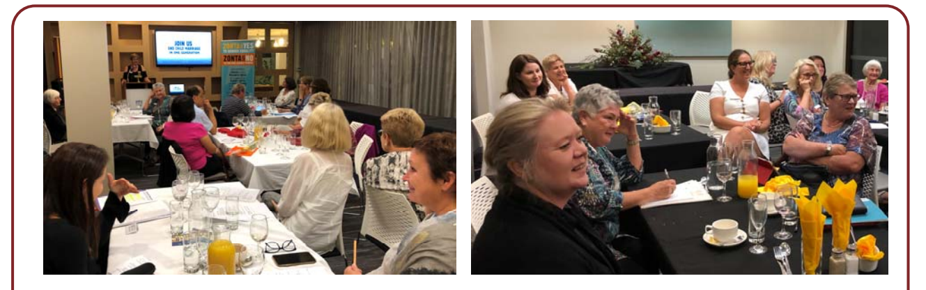
Members are brought up to date with the progress of International Projects at club meetings, through short videos, guest speakers' presentations and ZI reports.

We also acknowledge and thank the many guest speakers at our monthly dinner meetings for their passion and dedication in their respective fields of interest; we continue to make individual donations to ZI in their name.