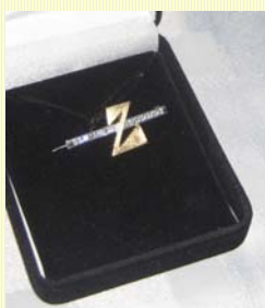
The Woman of Achievement brooch