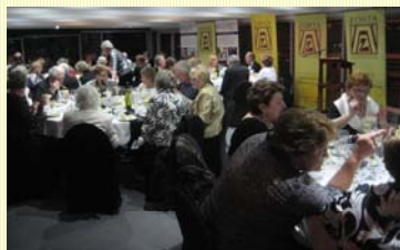
Zontians from the city as well as Dunsborough, Bunbury and Mandurah gathered for the event.

zontaperth@yahoo.com.au www.zontaperth.org.au PO Box 237 Nedlands WA 6909