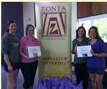
Students with their well deserved Certificates of Appreciation