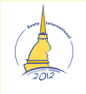
Will you be in Torino in 2012?

See the Convention webpage at http://torino2012.zonta.org/