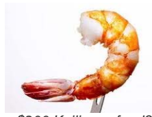
$200 Kailis seafood?