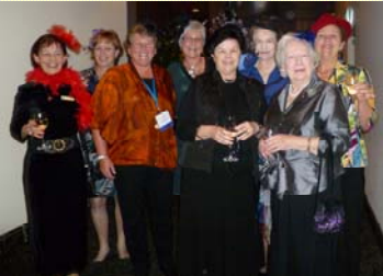
'Let the fun begin-' Saturday evening