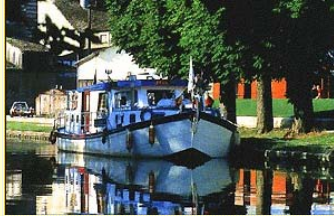
The beautiful Canal Lateral, France