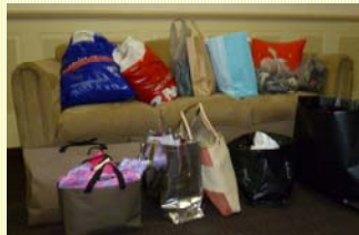
Donations for the refuge given at the August dinner meeting.

Your donation is not only practical and useful, but mainly it is the thoughts and generosity of spirit that means so much to us. Thank you so much.