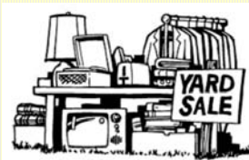
GIANT GARAGE SALE North Fremantle Bowling Club November 5 th and 6 th