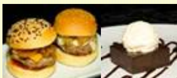
Available each lunch time @ SCWO Centre