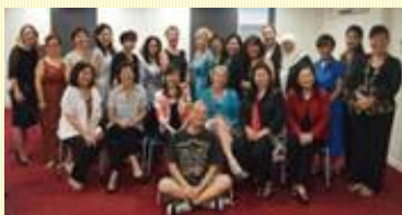
Singapore Council of Women's Organisations. (SCWO)