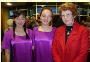
The girls chatted to the audience after the show.