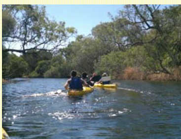
Kayaking on the Kent Weir

Members of the Zonta Club of Singapore sent greetings to the Perth Club, and would love to host members at their Club dinner if anyone is travelling to Singapore.