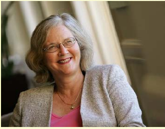
Dr Elizabeth Blackburn (from The Age website

http://images.theage.com.au/2009/10/05/771582/420-elizabeth-blackburn-420x0.jpg