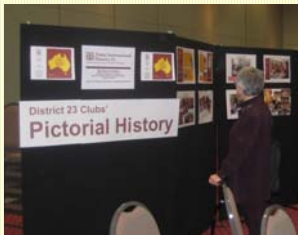
The static Pictorial Display...