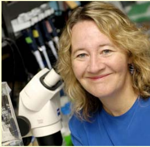
Dr Carol Greider (from

http://images.theage.com.au/2009/10/05/771582/420-elizabeth-blackburn-420x0.jpg