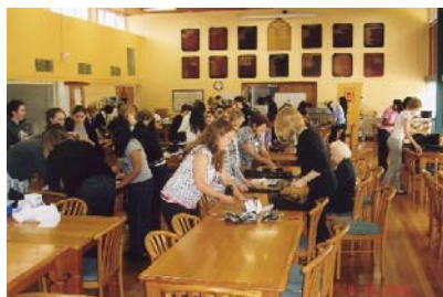
Everyone busy at the Birthing Kit Assembly Day