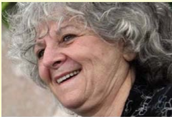
Professor Ada Yonath

http://www.hopkinsmedicine.org/dome/0610/images/story/subpages/1a.jpg