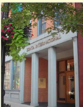
The Old ZI Headquarters building in Chicago

The video is seven minutes long and shows you through the building on a day when the International Board was having a meeting!