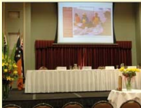
...was complemented by the dynamic PowerPoint rolling display