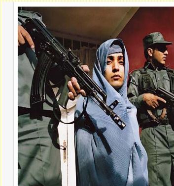
Malalia with her bodyguards at a secret address in the back streets of Kabul

Malalai Joya was elected into the first parliament after the fall of the Taliban. She was evicted after she spoke out against the warlords who now hold seats in the parliament and demanded that war criminals should be prosecuted. For the last five years she has been living under constant threat and now has to move between safe houses almost daily. Her book will bring the situation of Afghanistan into sharp focus. More can be found by 'Googling' Malalai Joya.