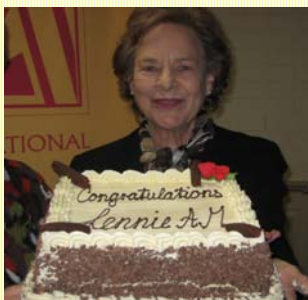
The cake before it became the dessert!