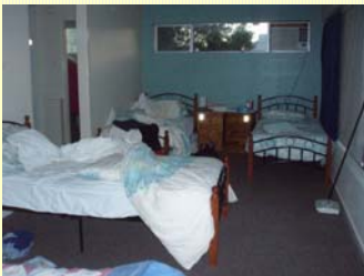
A not so neat and tidy shared bedroom