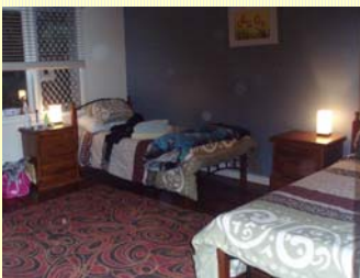
A neat and tidy shared bedroom