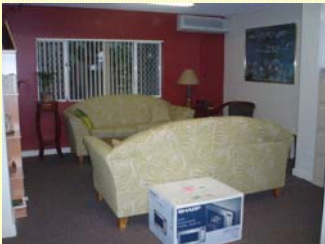
The sitting room in the main centre