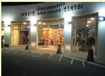
The impressive entry to the venue at Hale School

A peppercorn may have changed hands in the purchasing of the Zonta Troopy, but by the time I left it was worth its weight in gold - so on behalf of all the Gibb kids, Grannies and Mothers, once again a big watermelon smile and thank you to Zonta Mob !