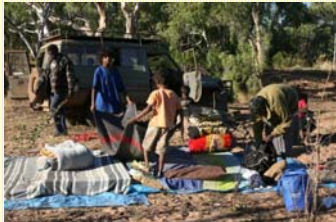
Packing up camp

Remember the generosity of Pat Johnson, Zontian extraordinaire from the USA who donated money for the fishing lines that were distributed to children at the schools at Gibb River and Mount Barnett communities? I am pleased to report that the kids continue to love the independence of having their own fishing lines, thus making its near impossible to cross a river without letting them have a fish - also a good excuse for the weary old girls to boil a billy and have a sit-down.