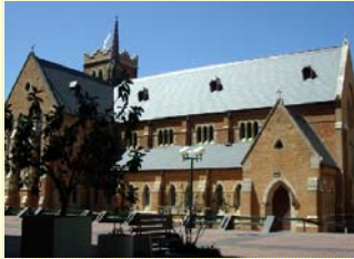
St George's Anglican Cathedral is hosting a special service for women affected by breast cancer, their families and friends.

Women affected by breast cancer, their families, friends, and health professionals are all warmly invited to attend a special service in St George's Cathedral at 12 noon on 26 th October.