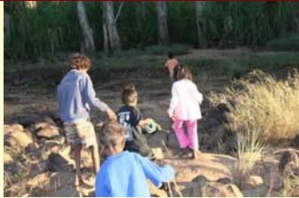
Kids off for a fish just as dawn broke on the King Edward River