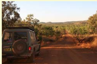
Heading towards Kulumbaru

Sciona and Wendy were right, there is still heaps of life left in their 'good idea'. So for the next 3 months whilst hanging out with the Gibb River mob, we must have driven thousands of kilometers, operating as a remote taxi service picking-up and dropping-off grandkids, but mostly using the 'good idea' for fishing and hunting.