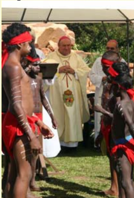
100 year Missionary celebration mass with Bishop of Broome and Kulumbaru boys

Pago (pronounced Parr-go) for those of the vintage to remember the mission boxes at school, is the original site of the Benedictine Mission settlement some 20 kms further North of Kulumbaru. Some thirty years later the Missionaries moved further South in search of better water and protection from cyclones. Sadly this will be the last year for the missionary nuns who left immediately after the 100 year celebration.