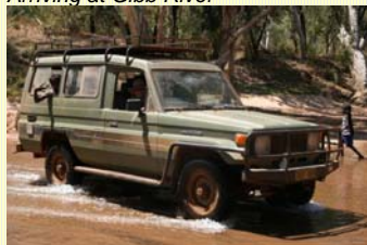
Zonta Green Troopy in action

Although the Zonta Troopy was given a clean bill of health before it left Perth, I still had a few reservations about driving a 20 year old Toyota on a long remote trip. But by the time I reached Derby and squeezed a few more bodies in on top of the pumpkins, I too had fallen in love with the old girl.