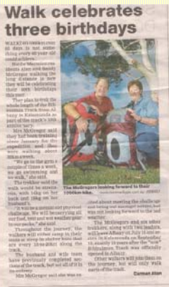
The walkers hit the headlines in the Community Newspapers.

We experienced some really hard and exhausting days but even on these days we had great fun. There is something really rewarding about getting to the end of a hard day. The friendships and support of the group each day was fantastic, and we shared many, many stories and laughs. There is something very special about being out on the track – it is simply a great place to be. It certainly was a journey of a lifetime for us both, such a fantastic experience.