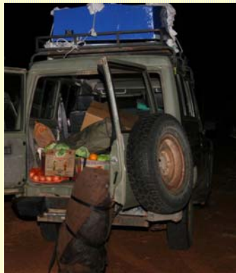
Arriving at Gibb River