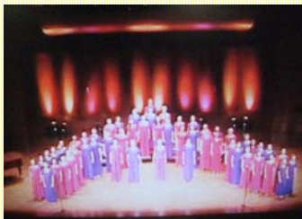
The girls sang beautifully and many of the songs had quite complex choreography too!

The many attendees were awed by the vitality and singing of the choir that wooed the audience with songs from around the world. There wasn't a dry eye in the house when they sang their signature tune of "I still call Australia home" as featured on the Qantas television advertisements. The body percussion