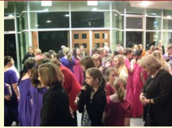
After the performance, the choir mingled with the audience

song will also remain as a vivid memory of the evening – the girls were marvellous. After the event the girls mingled with the audience and everyone was impressed with their poise, confidence and fluency.