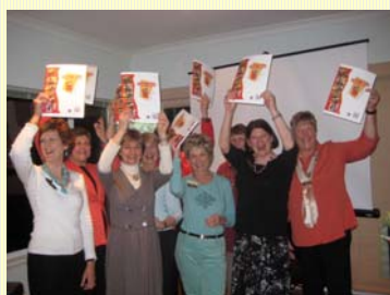
Board members proudly display Yarri Wada presentation packs.