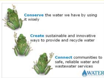
The Water Forever messages are Conserve, Create and Connect...

Karina’s first introduction to project development and implementation came as a