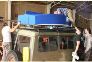
Up she goes!