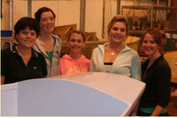
Some of the Fremantle Challenger TAFE boat building students who helped to construct the boat.