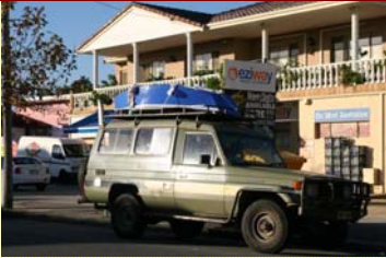
The Troopie heads up North with boat on top!