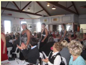
The models strut their stuff