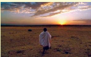
The film A Walk to Beautiful will raise funds for the Addis Ababa Hamlin Fistula Relief fund