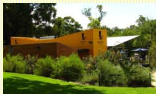
The energy efficient Zamia Café in King's Park