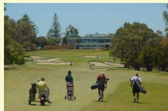
The Area 3 Workshop will be held at the picturesque Mandurah Country Club

Early bird discounts for registration finish on 31 st March 2008