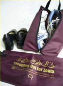
Zonta shoe bags

These items are on our Club's web site at www.zontaperth.org.au ?