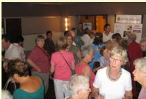
Zontians and guests mingling before the performance