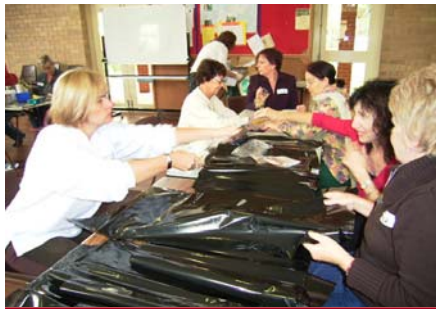
Birthing Kits from the October session will go to Vietnam

Remember how much fun we had at the last Birthing Kit Assembly day? Bring your friends and help pack more of these life saving kits.